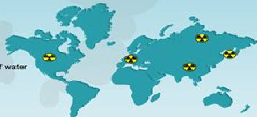
USA, France, China, Russia and South Korea

92% Highest capacity factor among energy sources, operating at maximum power most of the time.