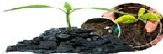
Plant nutrition application (organic fertilizer and biochar)