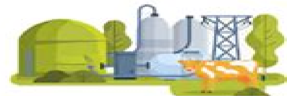
Biogas production application