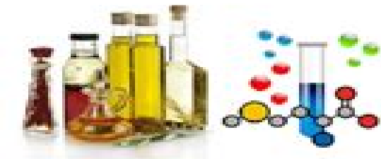
Food application (production of vinegar, oil, edible coatings, and bioactive compounds)