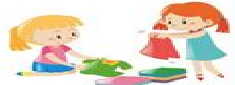
doblar la ropa