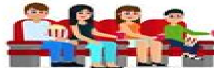
ir al cine