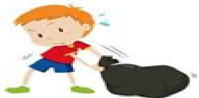
sacar la basura