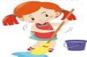
trapear el piso