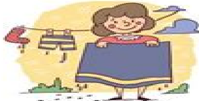
tender la ropa