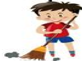
barrer el piso