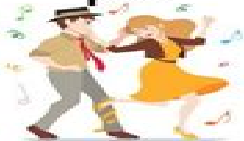
ir a bailar