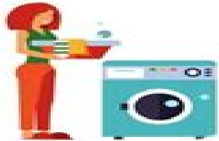
lavar la ropa