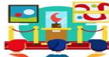
ir al museo