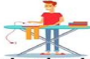
planchar la ropa