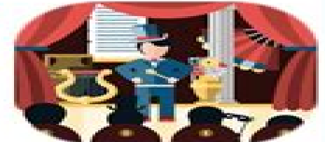
ir al teatro