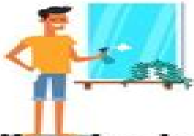
limpiar la ventana