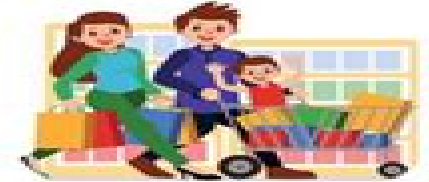
ir de compras