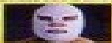
EL MASCARA EL