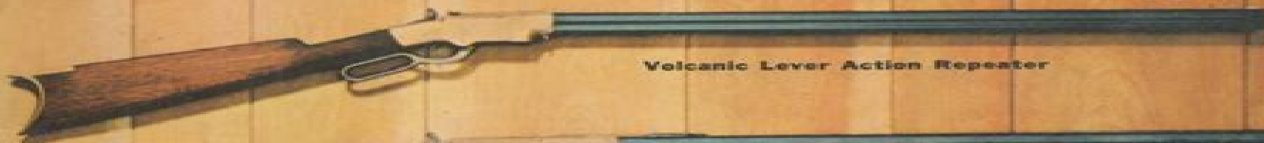
Volcanic Lever Action Repeater