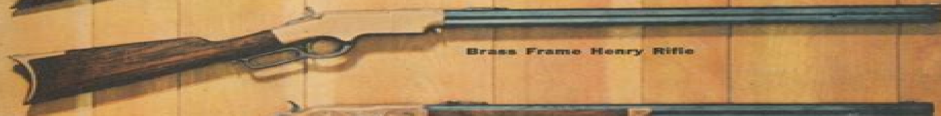
Brass Frame Henry Rifle