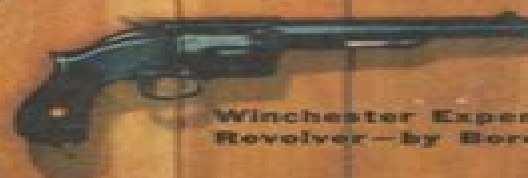
Winchester Experimental Revolver—by Borchardt