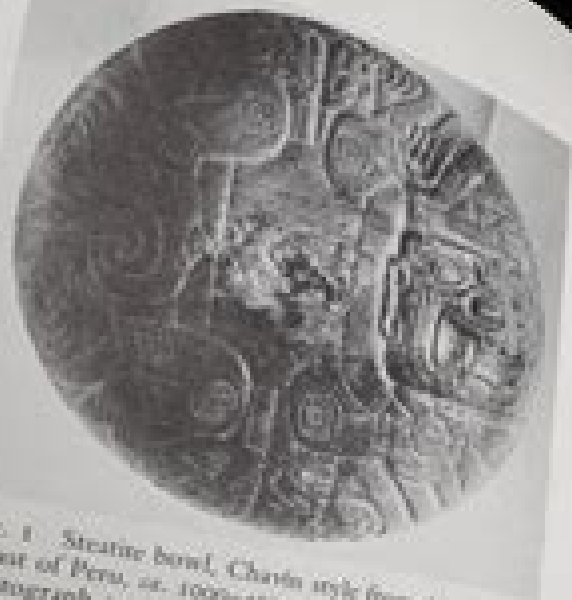
Fig. 1. Steatite bowl, Chavin style from the North Coast of Peru, ca. 1000-400 B.C. Diameter 17.8 cm.

modern thread; no doubt somebody showing off his expertise pointed out the error to the seller, or merely allowed him to see it by the way he examined the dolls.