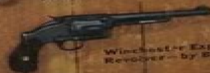
Winchester Experimental Revolver - by Berdanist