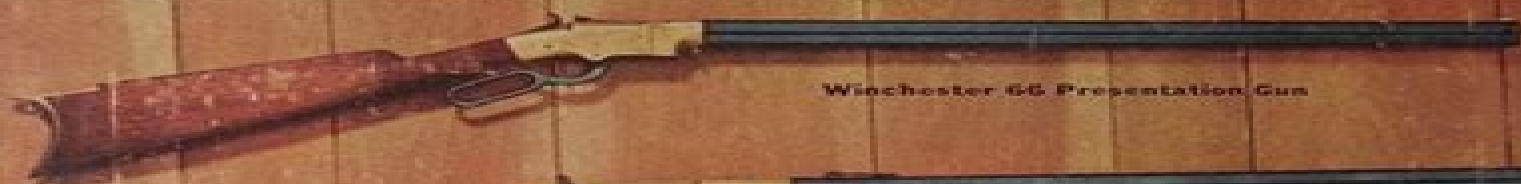
Winchester 66 Presentation Gun