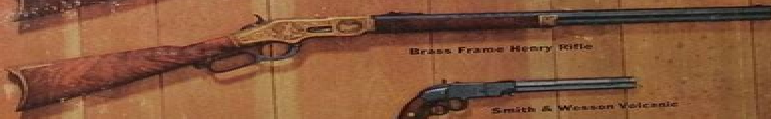
Brass Frame Henry Rifle