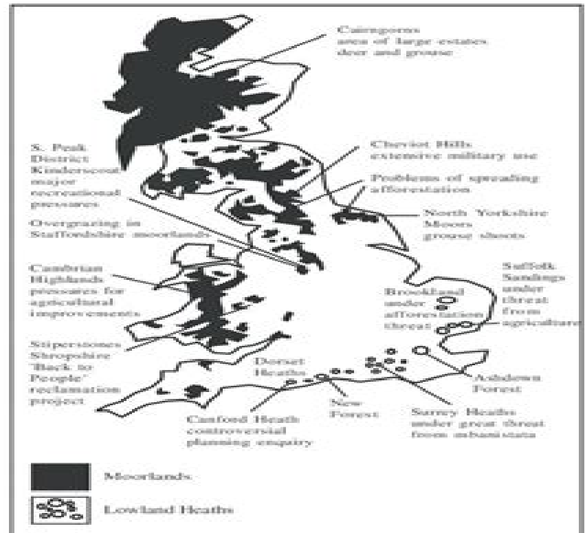
Fig 2. Distribution of Heathlands in Great Britain

However whilst it is possible to distinguish between lowland heaths and upland heather moorlands and they form two very distinctive ecosystems (see Figs 3a and 3b overleaf) they do have many common features (see p3).