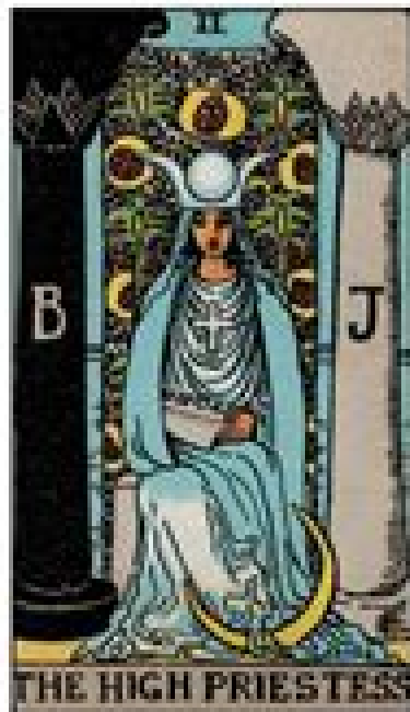
THE HIGH PRIESTESS.