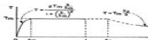
Figure 1. The speed-torque curve of a constant-torque motor.