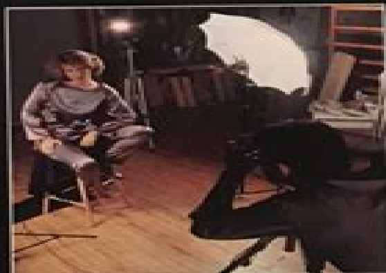
Learn advanced techniques