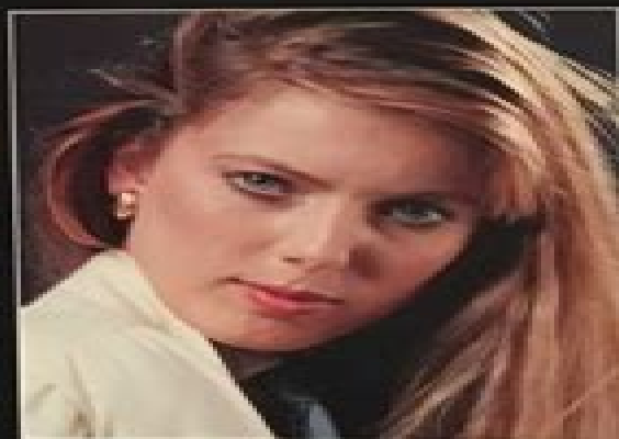
Get great pictures