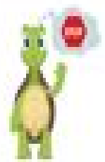
Step 2. Step your trade.