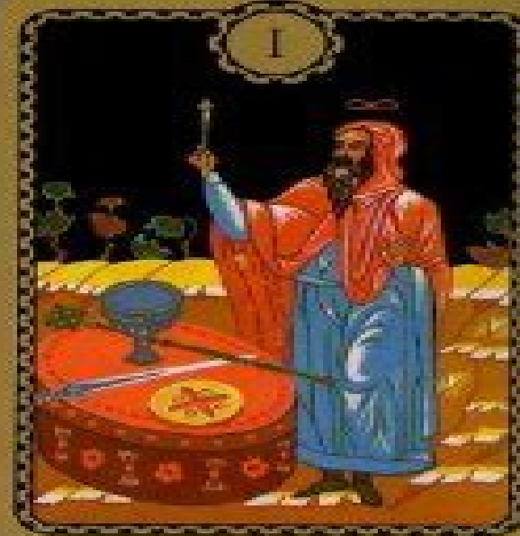
THE MAGICIAN DER MAGIER / LE BATELEUR