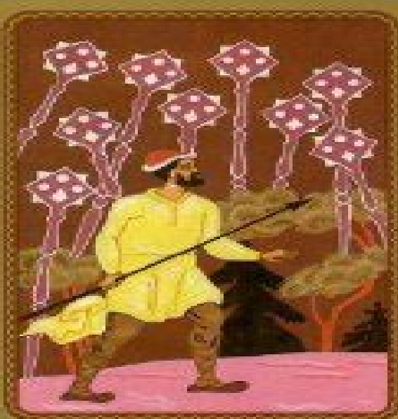
NINE OF WANDS STAB NEUN / CASTIF DE BAZON