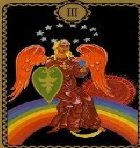
FERTILITY DIE FRUCHTBARKEIT / LA FERTILITE