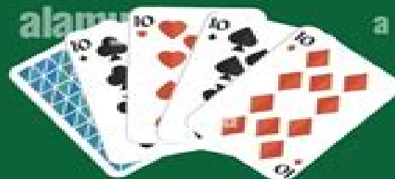
Four of Kind