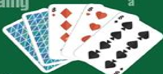
Three of Kind