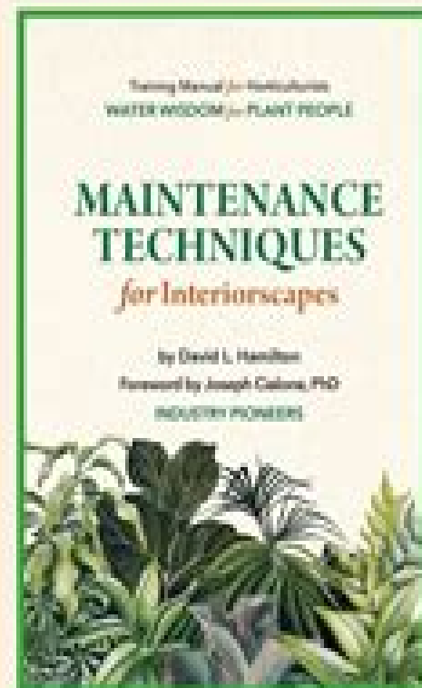
Horticulturist Training Manual ISBN 978-1-953120-77-9