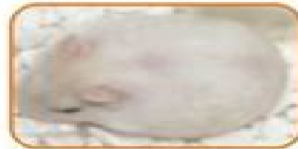
pearl white eared