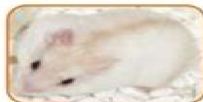
pearl yellow line