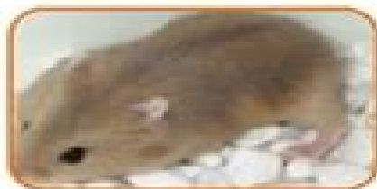
argente black eye