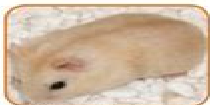
golden white eared