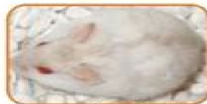
pearl red eye