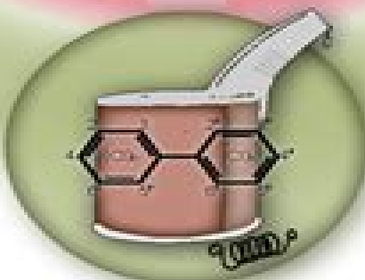
Polychlorinated Biphenyls (PCB)