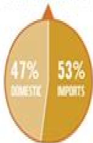
EU ENERGY SUPPLY