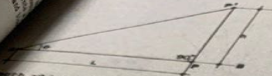
Fig. 11-3. Laying off an angle using a perpendicular line.