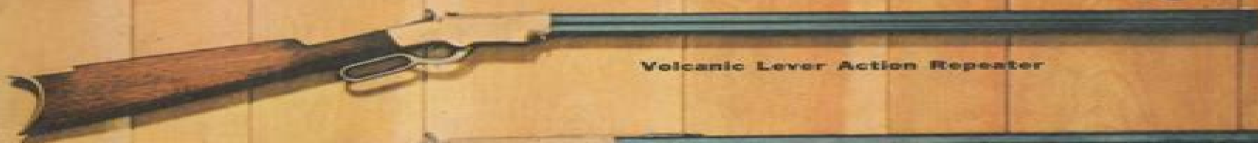
Volcanic Lever Action Repeater