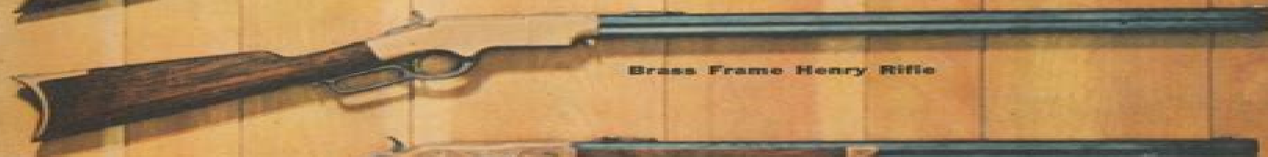
Brass Frame Henry Rifle