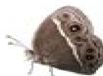
Common Bush Brown ( Bicyclus safitza )