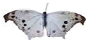
Forest Mother-of-pearl ( Protoparce parhassus )