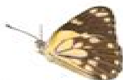
African Common White ( Belenois creona )