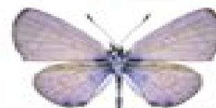
African Babul Blue ( Azanus jesous )