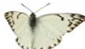
African Veined White ( Belenois gida )