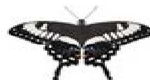
Emperor Swallowtail ( Papilio ophidicephalus )