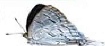
Purple-brown Hairstreak ( Hypolycaena philippus )