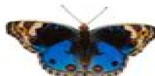
Blue Pansy ( Junonia oenone )