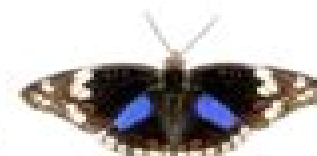
Dark Blue Pansy ( Junonia oenone )