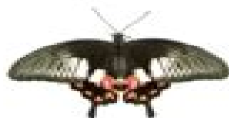
Black Swordtail ( Graphium colona )