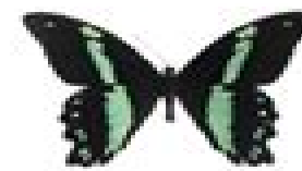
Green-banded Swallowtail ( Papilio nireus )