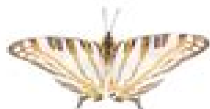
African Map Butterfly ( Cyrestis camillus )