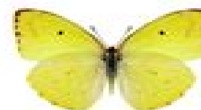
African Migrant ( Catopsilia florella )