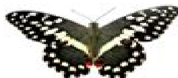
Citrus Swallowtail ( Papilio demodocus )