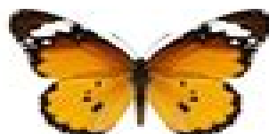
Plain Tiger ( Danaus chrysippus )