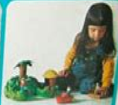
Hours of fun with Gilligan and friends.