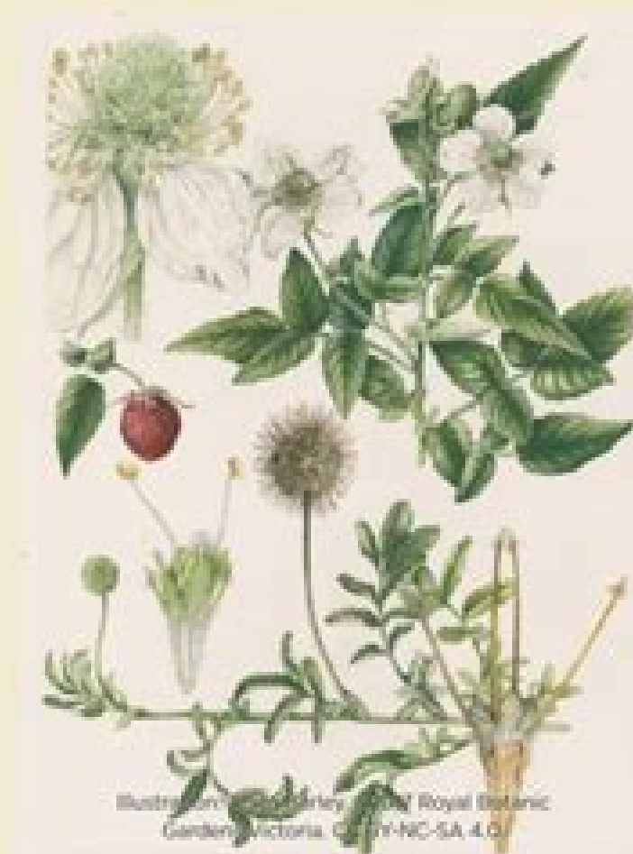
Illustration of Mimosa by the Royal Botanic Gardens Victoria, CC BY-NC-SA 4.0

Glinn asteromphala subsp. rotundifolia , described in 2014 is known only from the summit area of Mt Lang Ghrien.