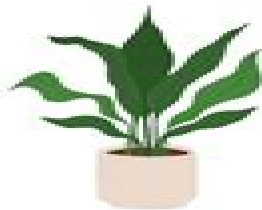
CAST IRON PLANT