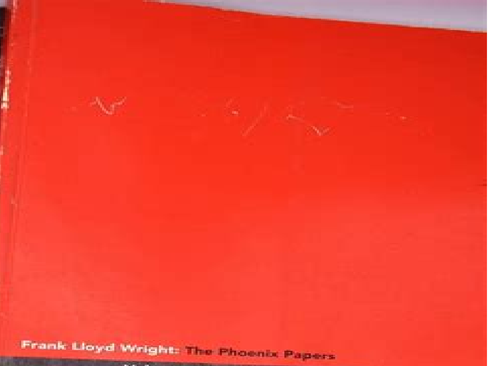
Frank Lloyd Wright: The Phoenix Papers