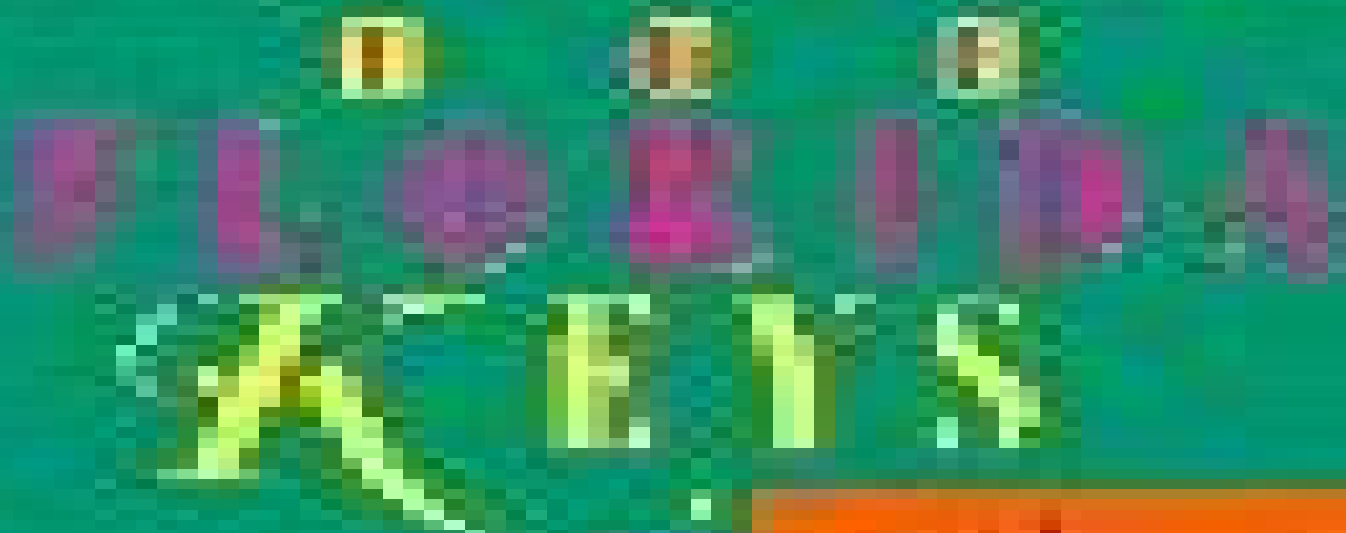
Three people in purple shirts and white pants standing in a row on a green field.