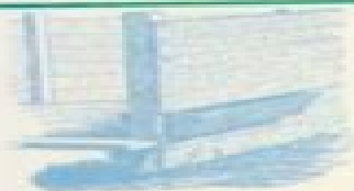
convenient pig trough