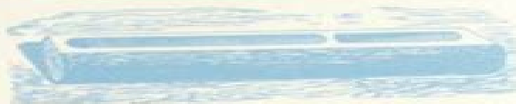
hewn-cut pig trough