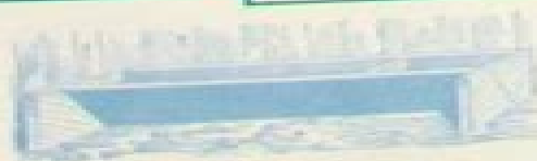
plank pig trough