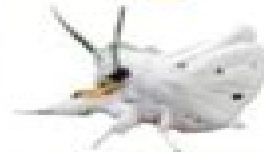
Venezuelan Poodle Moth