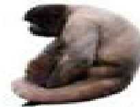
Brown Woolly Monkey