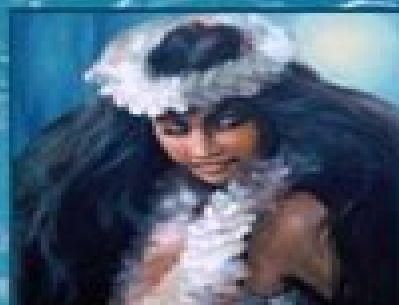
HINA MOON GODDESS