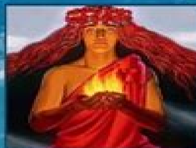
PELE VOLCANO GODDESS