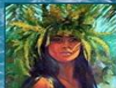
LAKA VEGETATION GODDESS