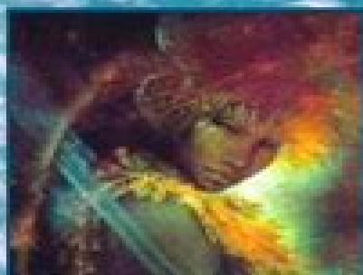
WAKA LIZARD GODDESS