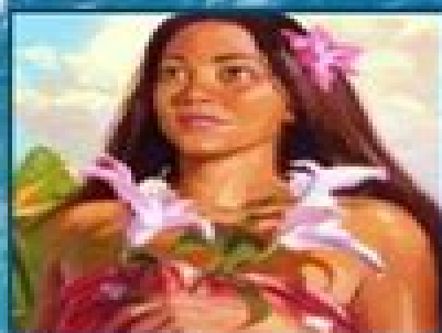
HAUMEA FERTILITY GODDESS