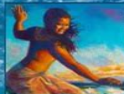
HI'AKA GODDESS OF DANCE