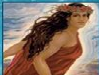
LILINOE GODDESS OF MISTS