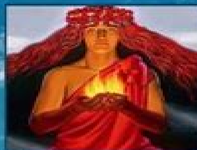
PELE VOLCANO GODDESS