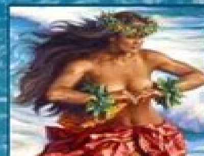
NĀMAKA WATER GODDESS