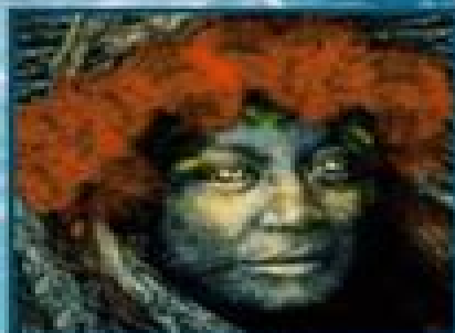
PAPA EARTH MOTHER