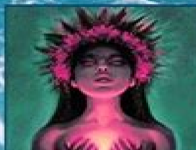
KAPO GODDESS OF SORCERY