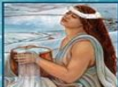
POLI'AHU SNOW GODDESS