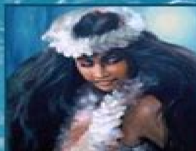
HINA MOON GODDESS