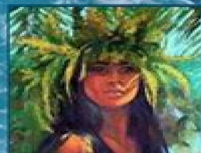
LAKA VEGETATION GODDESS