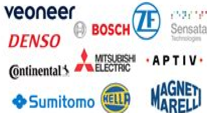
Notable Emerging Companies in Automotive ECU Market