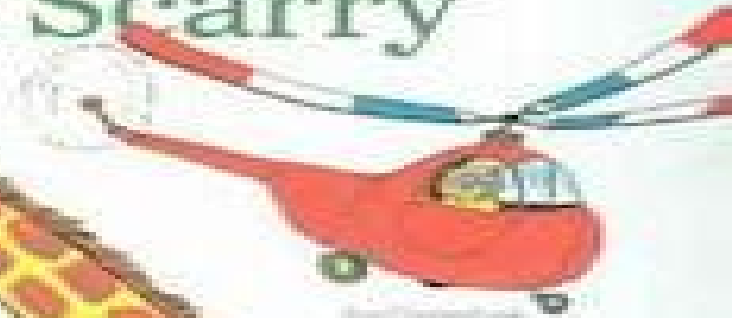
¡volando! el helicóptero