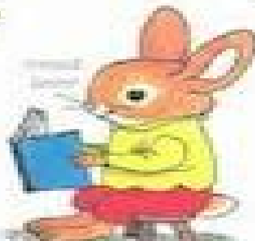
¡leído! el libro