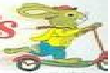
¡adelante! el patinador