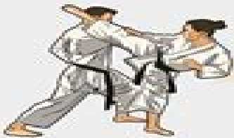
Mixed martial arts