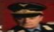
ROBERT VAUGHN as Erhard Milch