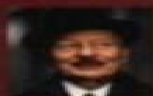
SIR JOHN GIELGUD as Albert Speer, Sr.