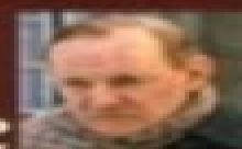
TREVOR HOWARD as Heinrich Tessenow