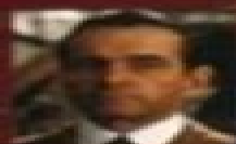
IAN HOLM as Josef Goebbels