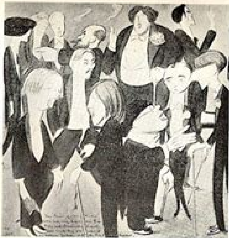
See MAX BECKMANN: Some Figures of the 'Nineties