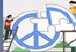
Peace and Development