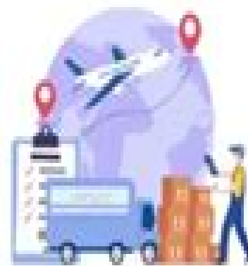
Marketing and Distribution