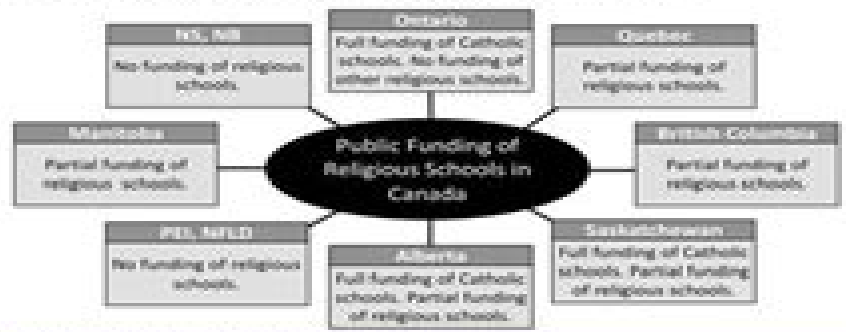
Figure 1: Status of Faith-Based Funding Across Canada

When it comes to education policy, why is a revision of Catholic school public funding necessary in Saskatchewan? Three policy alternatives are presented to contest this problem, concluding with our policy recommendation.