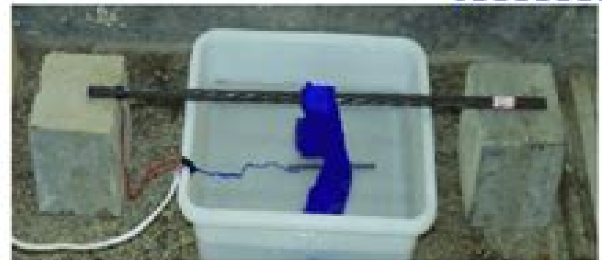
The electrochemical accelerated corrosion of S1 in situ