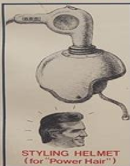
STYLING HELMET (for "Power Hair")

Quality-of-life-enhancing products you won't want to live without!