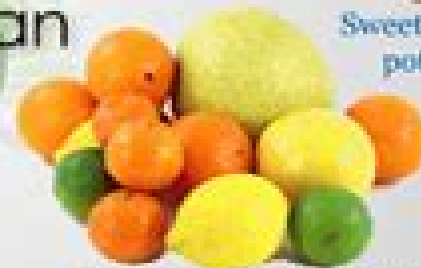
Citrus - Your daily soluble fiber and vitamin C