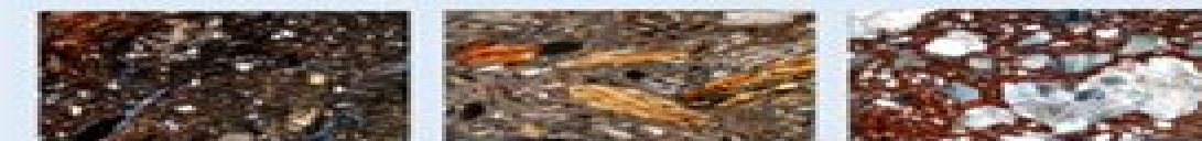
Fig. 6. Petrophotographs of three varieties of three fabric groups of handmade pottery from Perikakia. FG 1 with almost granitic matrix (PER_34, left), FG 2 with phyllite (PER_36, middle) and FG 3 with granite (PER_33, right). Scale, 1 mm.

Six examples of such pottery were subjected to petrographic analysis. The small number of samples reflects the relative rarity of such pottery at Perikakia. They fall into three fabric groups (FG). Two of them are extremely coarse fabrics that show a similar texture, characterized by unimodal size distribution and tight packing of inclusions that often reach 4 mm in the widest dimension (Fig. 5). As a result of this coarseness and texture, there is not much clay matrix between the inclusions. The clay is rich in iron (W/D XRF analysis of sample PER_33 showed over 12% of iron oxide). The third group has also unimodal size distribution of inclusions, but they are clearly less densely packed than in the other groups (Fig. 6 right). Clay is also much poorer in iron.