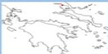
Fig. 1. Map of Greece indicating the location of Perikakia.