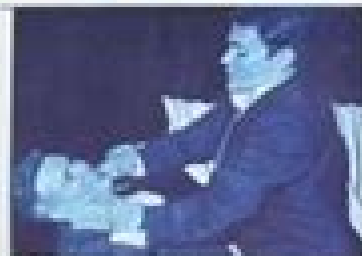
The ill-fated hands that belong to another!