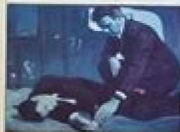
The surgical shock that leads to crime!