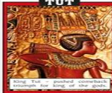
King Tut - pushed comeback triumph for king of the gods.

Tut Tut, 9, announced the togethery turn-around after high-level discussions with palace advisors. "Amun is now top god again, and his shrines and statues will be making a