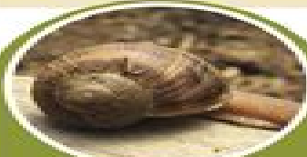
SNAILS & SLUGS MOLLUSCS