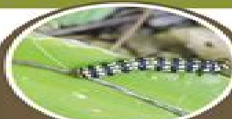
LILY BORER CATERPILLAR