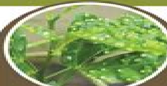
PSYLLA SAP-SUCKING INSECT