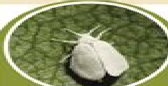
WHITEFLY SAP-SUCKING INSECT