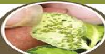
APHIDS SAP-SUCKING INSECT