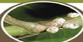
SCALE SAP-SUCKING INSECT