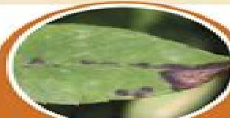
BLACK SPOT FUNGAL DISEASE