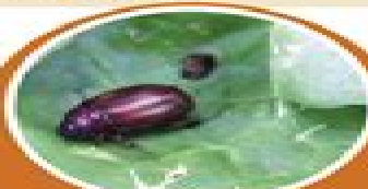
CHAPER BEETLE LEAF-EATING INSECT