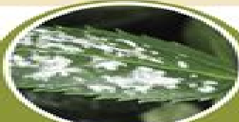
POWDERY MILDEW FUNGAL DISEASE