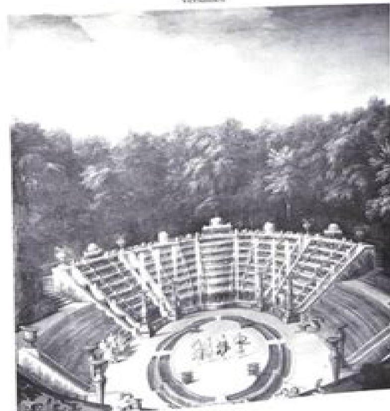
Plate 17. Versailles, Suite de Bell, showing the Grand Fontaine