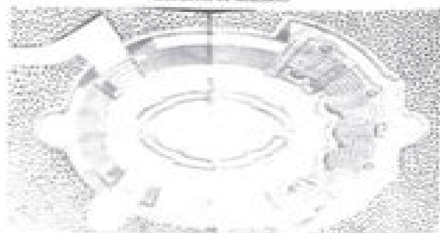
Plate 16. Versailles, Suite de Bell, plan