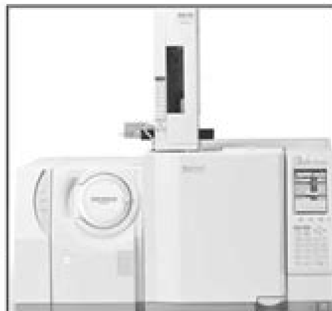
Figure 32-1 Block diagram of a typical gas chromatograph.