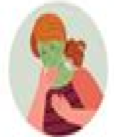
Nausea and Vomiting