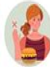
Loss of appetite