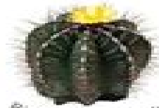
Bishop's cap cactus