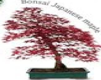
Bonsai Japanese maple