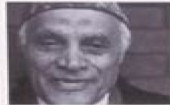
BLACK & WHITE